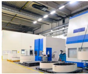
Presses, injection molding machines, gear housings