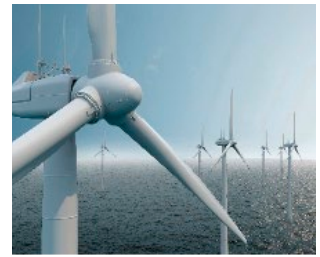
Special components in wind and waterpower generation