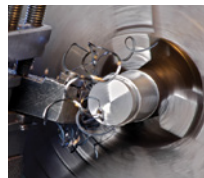
Machining & Turnkey Manufacturing