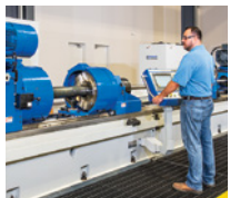
Deep Hole Drilling

Machining of highly alloyed steel and nickel alloys requires metallurgical expertise and specialist equipment. We offer an extensive range of machining services that exceeds industry expectations. As a result, we can turn and machine a wide product range of products in-house to your most demanding specifications. Our advanced lathes can turn parts as small as 1.00" diameter up to 32.00" and 177.00" long between centers. And our enhanced hollow spindle capability allows us to machine extra-long products up to 14.00" in diameter and 44 feet long.