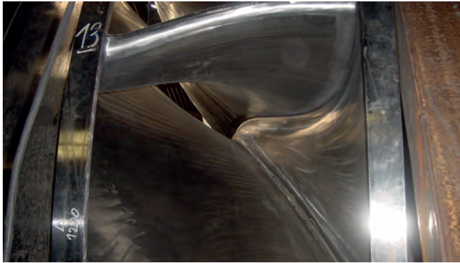
Close up view on a Francis turbine.