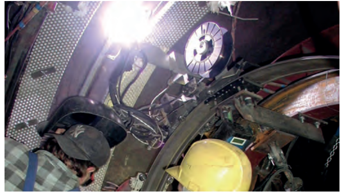
Penstock Kaprun, Austria. MCE staff control the fully mechanized GTAW hot wire process