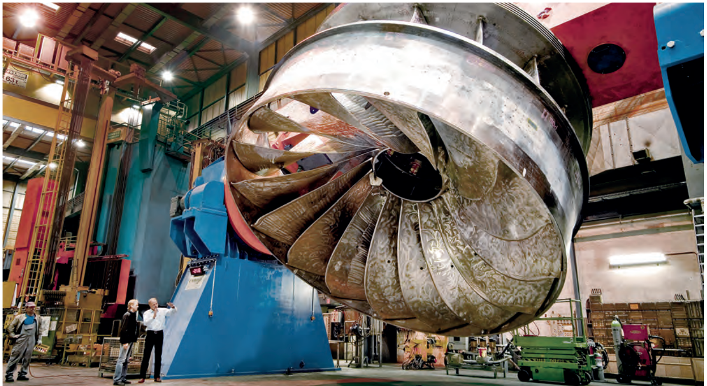
Francis turbine