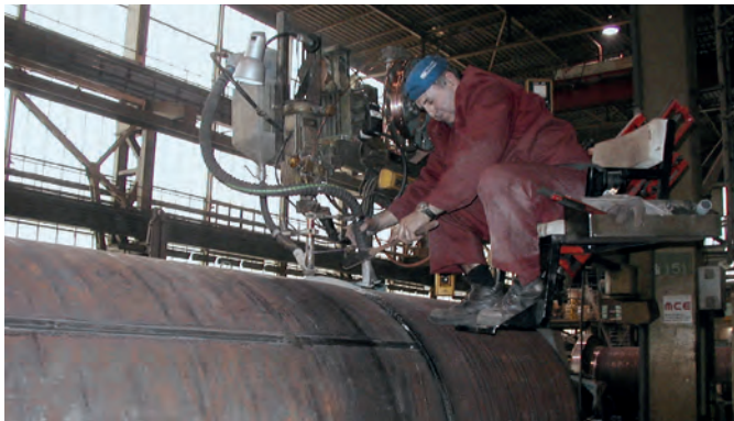
Prefabrication of the Penstock Kaprun, Austria. Steel grade S 690 Q, STM A514 Gr.F