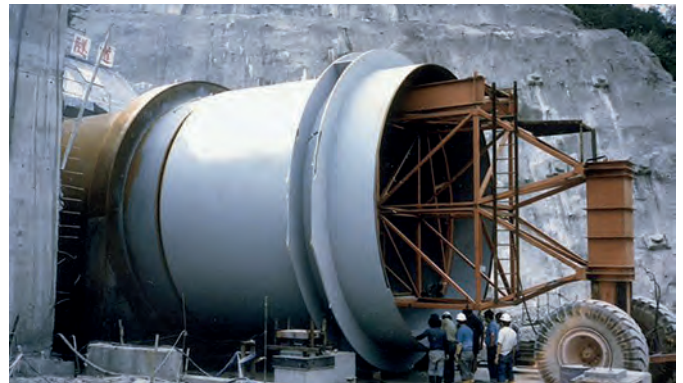
Prefabrication of the Penstock Kaprun, Austria. Steel grade S 690 Q, ASTM A514 Gr.F