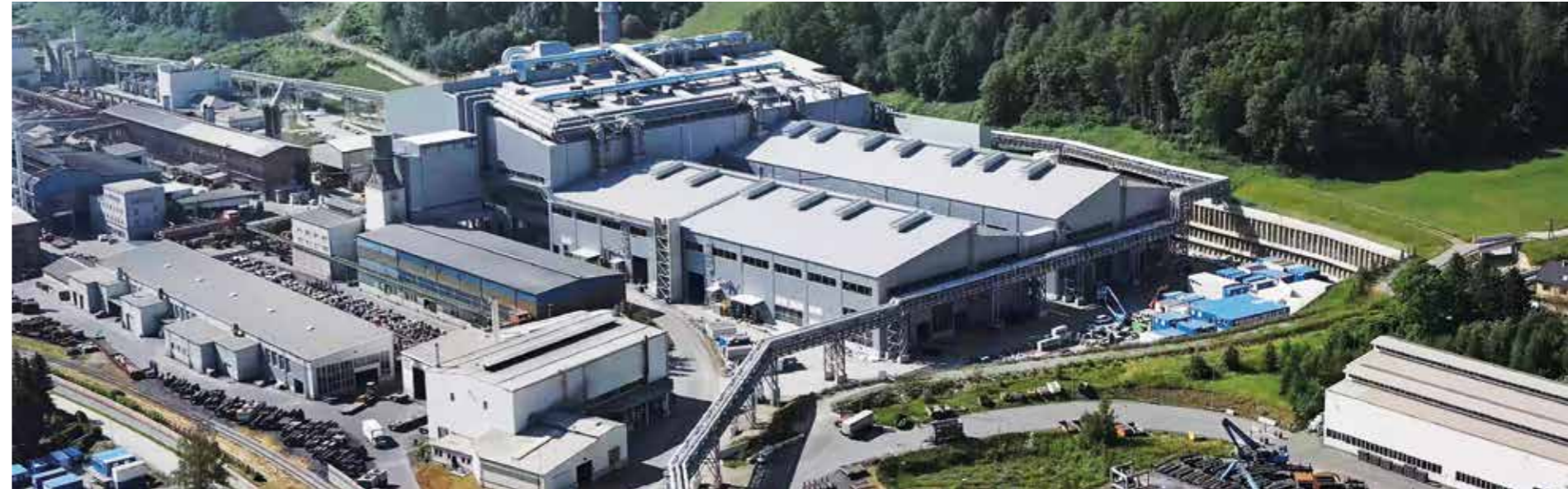
The new special steel plant in Kapfenberg sets new standards for product quality and sustainability.