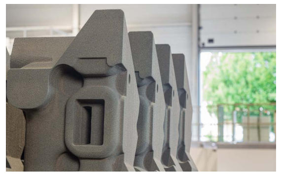
Please find further information at